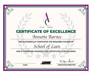
Download your Certificate of Achievement after successfully completing the course.