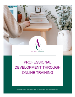
Included in your new member packet is a listing of all courses.